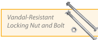
Vandal-Resistant Locking Nut and Bolt