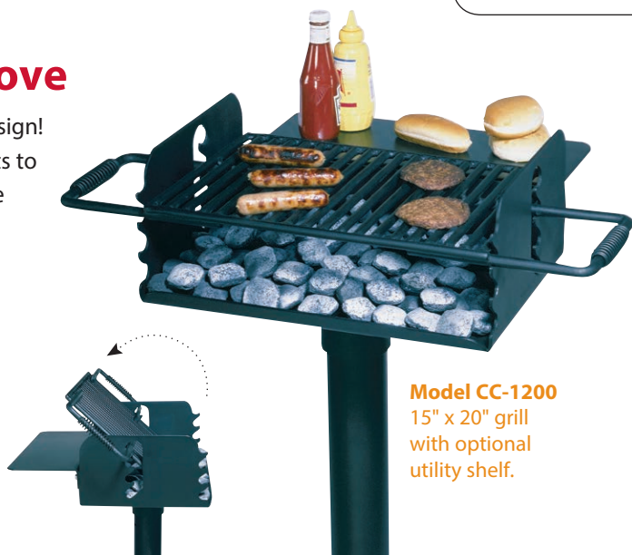
Model CC-1200 15" x 20" grill with optional utility shelf.