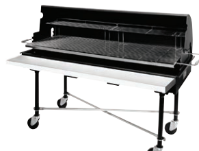
Shown with optional warming rack, full length shelf, X-braces and PORTA-Shield.