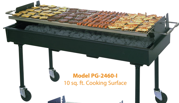
Model PG-2460-I 10 sq. ft. Cooking Surface

The PORTA-GRILL® I is big enough and rugged enough to feed large gatherings, yet light enough to be transported without a trailer. It glides on 5" casters for short trips; removable legs for long trips. Massive 24" x 60" (10 sq. ft.) or 24" x 36" (6 sq. ft.) sanitary nickel-plated cooking grate is made from 1/4" and 1/2" round steel bars with "U" channels welded to the front and back edges for maximum strength. It easily adjusts to four different cooking heights with "Cool-Spring" safety grips. Patented flip-back grill feature allows for easy charcoal servicing and clean out. Firebox is constructed from 1/8" thick (12 ga.) steel which is 41% stronger and more durable than 14 ga. steel. Four extra heavy-duty 4 1/4" wide x 3/8" thick steel channels welded to the underside of the firebox provide additional reinforcement. Legs are made from 1 1/2" O.D. structural pipe with one end threaded for quick and easy fastening to the firebox. Entire unit is coated with a non-toxic, heat-resistant, flat black enamel finish. Speed up cooking time and conserve fuel by using a Bread-Box Hood with built-in thermometer or a New PORTA-Shield (both sold separately).