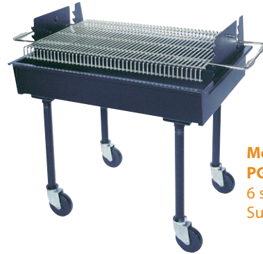
Model PG-2436-I 6 sq. ft. Cooking Surface