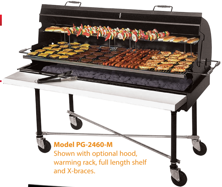
Model PG-2460-M Shown with optional hood, warming rack, full length shelf and X-braces.