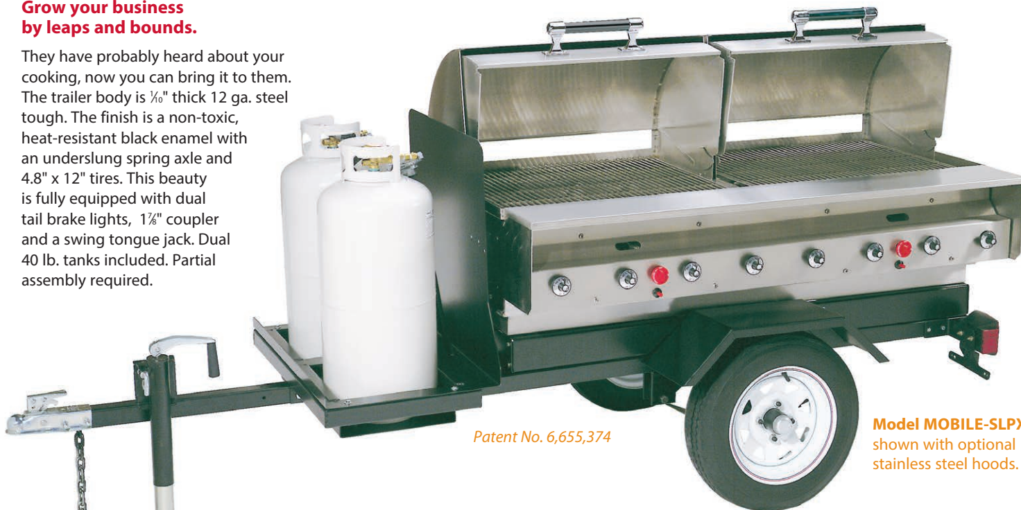
Model MOBILE-SLPX shown with optional stainless steel hoods.

They have probably heard about your cooking, now you can bring it to them. The trailer body is 1/8" thick 12 ga. steel tough. The finish is a non-toxic, heat-resistant black enamel with an underslung spring axle and 4.8" x 12" tires. This beauty is fully equipped with dual tail brake lights, 1 7/8" coupler and a swing tongue jack. Dual 40 lb. tanks included. Partial assembly required.