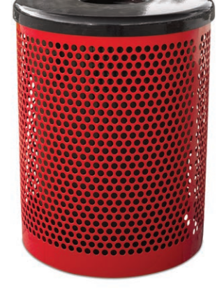
PR-32 with FTR-32-08