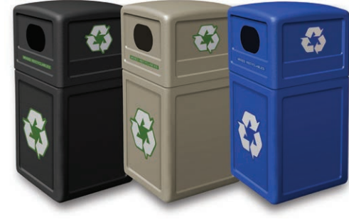
Color Options black beige blue