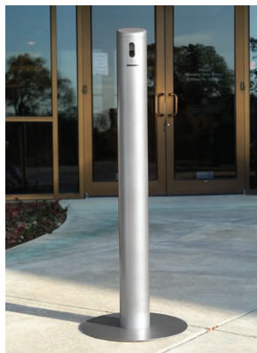
Metal Finish Color Options