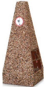
Exposed Aggregate Color Options

These designer concrete cigarette receptacles, constructed with steel-reinforced concrete, help reduce unsightly cigarette waste outside your facility. Maintenance is a breeze – simply open the stainless steel side door and empty the galvanized collection bucket. Galvanized waste bucket is included. Receptacles are available in exposed aggregate (below) or concrete finishes (shown online).