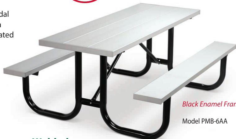
Black Enamel Frame